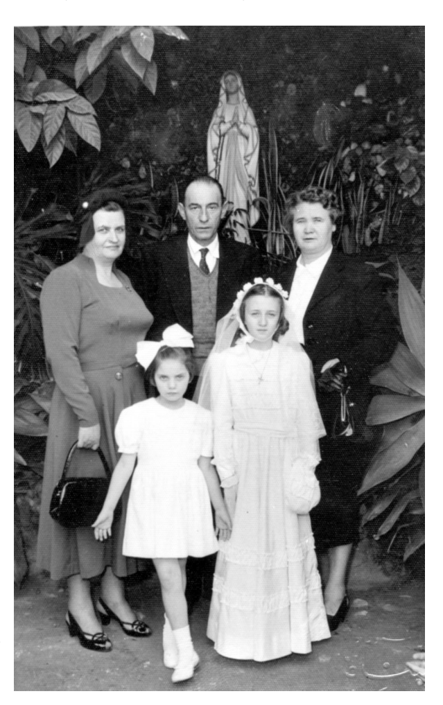
Photo 3. A Slovene family in Egypt, taken in Alexandria in 1955. In 1958 they left Egypt and emigrated to Goriška.

One woman born in Alexandria in 1946, whose family came to Goriška in 1958, mentioned how in her new home there was no running water and no bathroom, such as they had enjoyed in their apartment in Alexandria; nor was there any street-lighting or school buses.